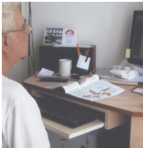
Shows a stroke patient unable to speak, but able to communicate via computer to his great joy