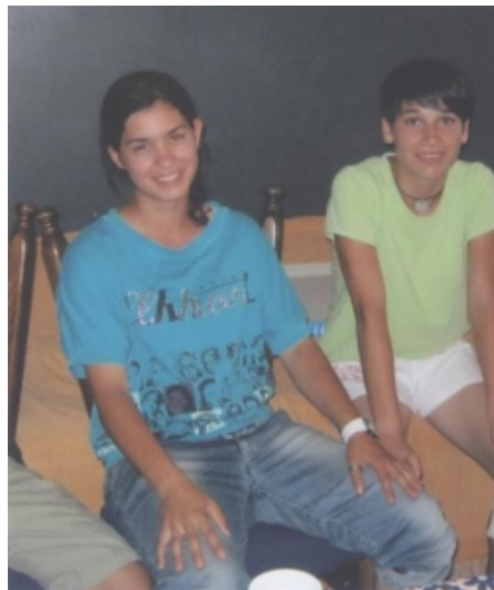
Shows a couple of the young people who benefit from the work of the Home