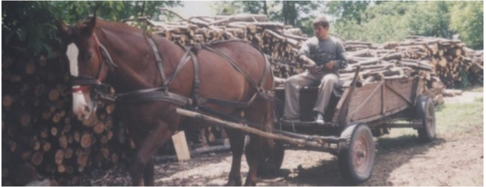
Gathering winter fuel at Brincovenestri

★ God bless and keep you all this Christmas ★