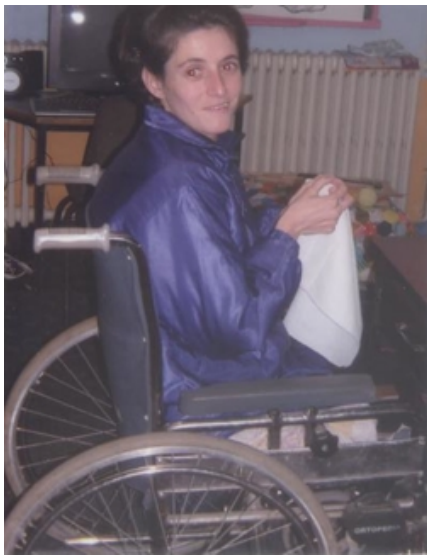
Enjoying making something beautiful