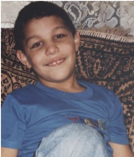
One of the boys at Glodeni