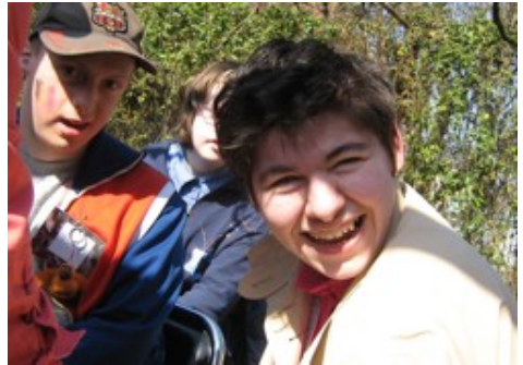
Looking forward to their holiday in the mountains