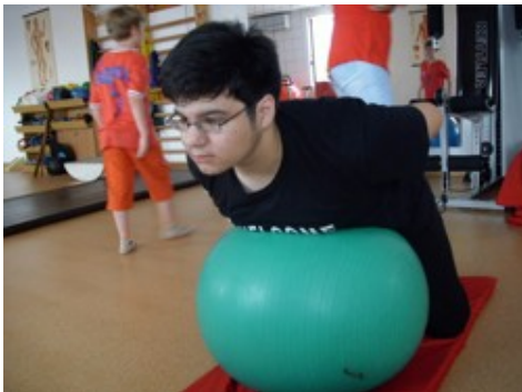
Rehabilitation exercises for back problems