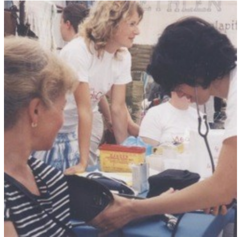
Two of the Medicare nurses giving general health checks at a public day in the town centre