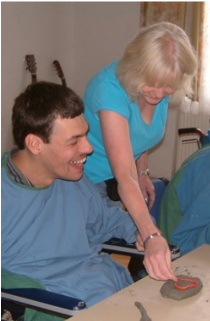
The pottery workshop