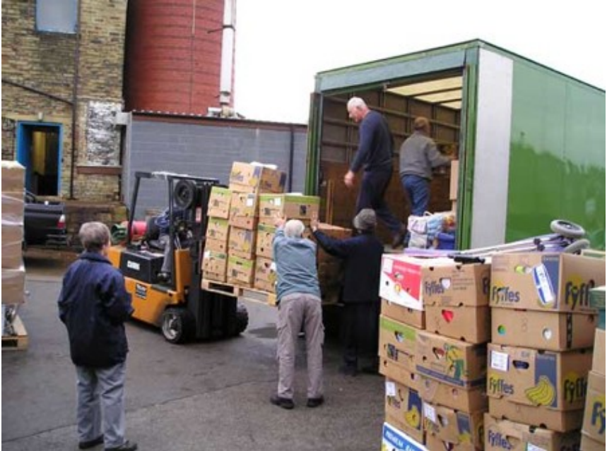
Loading the Firefighters’ old jam truck at the JOY warehouse in Windhill before it heads off to Romania.

The “Firefighters’ Aid” group from Essex have been helping JOY for ten years now, by taking truck loads of aid to Romania for us, which they fund themselves. Over the years, they have become our very good friends, and have become very committed to our friends in Romania. They collect goods for us (way down in the deep south there!) and have had stair lifts renovated for us, and then they fitted them on site in Romania- two in the Rheumcare rehabilitation centre and one in the chapel at the Christian Camp in Harghita. Here’s to the next 10 years!!.